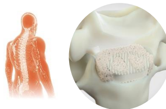
GlassBone ® Bioactive Bone Substitute