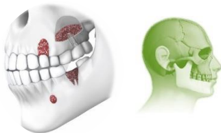
BiologicGlass Bioactive Bone Substitute