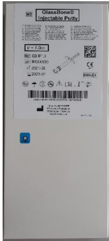
Picture of the cardboard box containing the pouches and the syringe (labelled side)