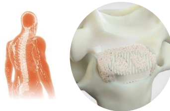
GlassBone ® Bioactive Bone Substitute