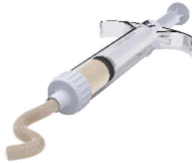
Picture of a syringe as represented in the brochure