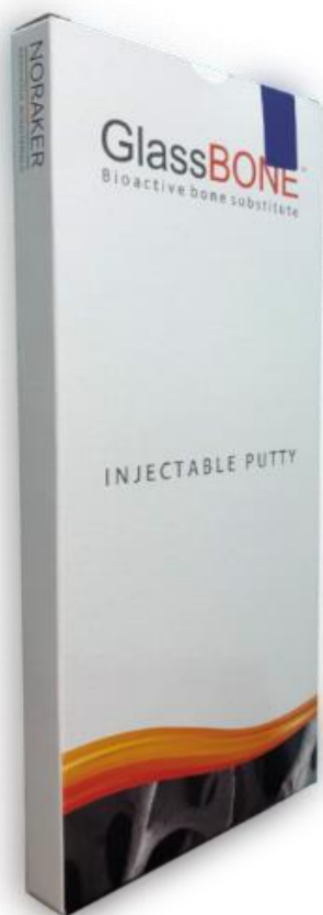
Picture of the cardboard box containing the pouches and the syringe (unlabelled side)