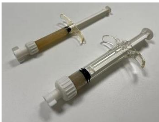
Picture of a small and medium syringes containing the putty