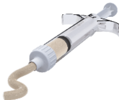
Picture of a syringe as represented in the brochure