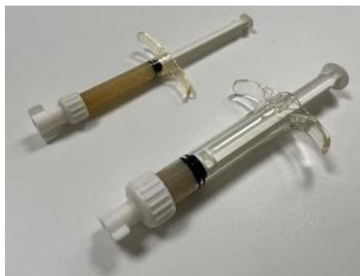
Picture of a small and medium syringes containing the putty