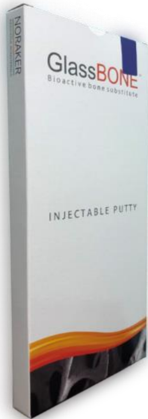
Picture of the cardboard box containing the pouches and the syringe (unlabelled side)