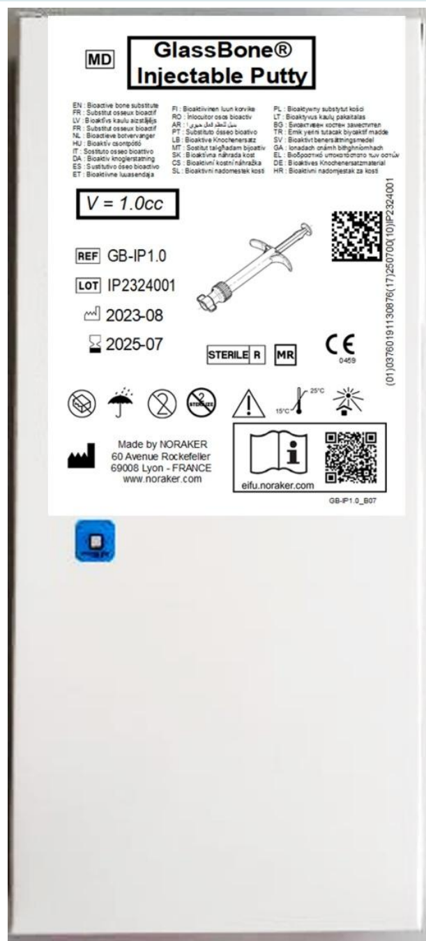
Picture of the cardboard box containing the pouches and the syringe (labelled side)