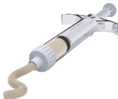
Picture of a syringe as represented in the brochure