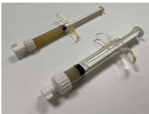
Picture of a small and medium syringes containing the putty